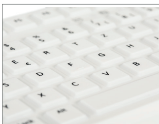
IP68 - keyboard and mouse