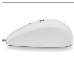
high resolution laser sensor: 1500 dpi