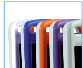
Different colors blue, orange, purple, white, gray