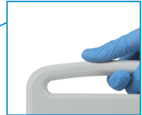
Practical handle Provides mobility