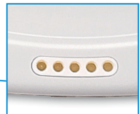
Induction Charge without cable