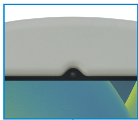
Camera recess Front and back