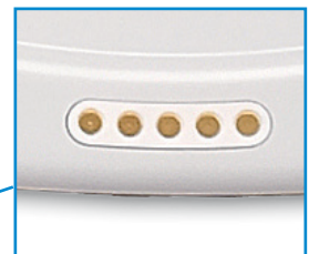
Induction Charge without cable